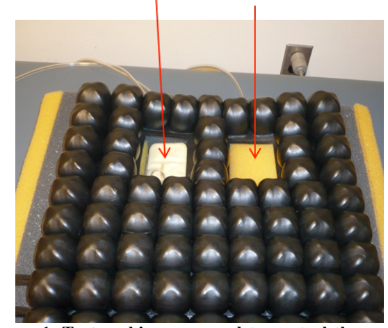
Figure 1. Test cushion was used to control the pressure at the IT. (Reproduced from (Sprigle et al., 2013), modified to add text)

The data collection protocol began with the IT unloaded for 5 minutes, followed by 2 minutes at a low load (40-60 mmHg) and 2 minutes at a high load (> 200 mmHg). This unloaded \rightarrow low load \rightarrow high load sequence was repeated 3 times. The Laser Doppler Flowmeter was configured to record the blood flow flux at a sampling rate of 32 Hz and the interface pressure sensor measured the interface pressure at 1 Hz.